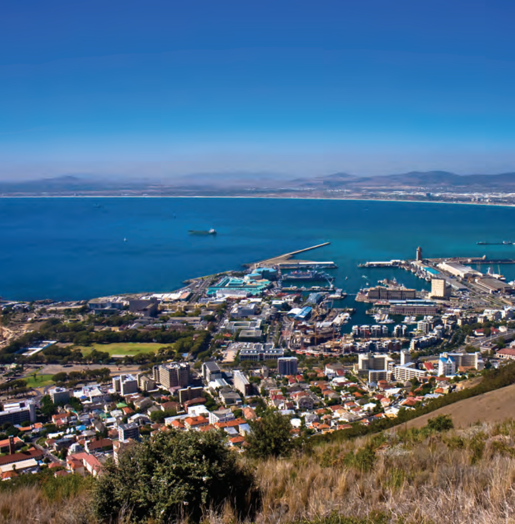
Clockwise from left: Victoria and Alfred Waterfront, Cape Town; 60 Thompson, New York; The Caves, Jamaica; 60 Thompson New York; The Wynn, Las Vegas