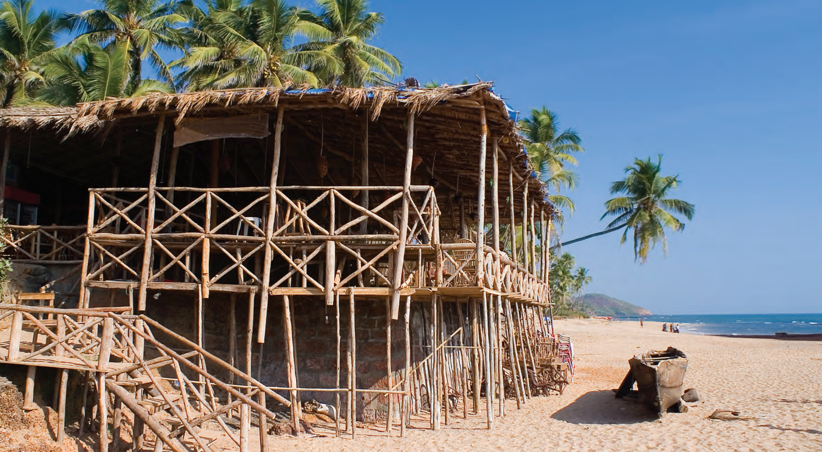
Clockwise from left: Beach in Goa, Parrot Cay, Turks and Caicos; The Oberoi, Mauritius; The Hotel at Mandalay Bay, Las Vegas; The Hudson Hotel, New York